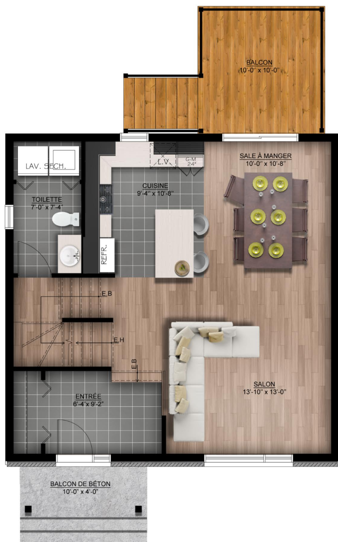
REZ-DE-CHAUSSÉE SUP.TOTALE: +/- 676 pi.ca. MONACO 5